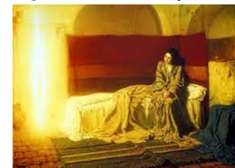
The Annunciation by Henry Ossawa Tanner (1859-1937)

December 8 is the Patronal Diocesan Feast: