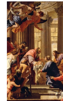
Presentation in the Temple is a painting by Simon Vouet