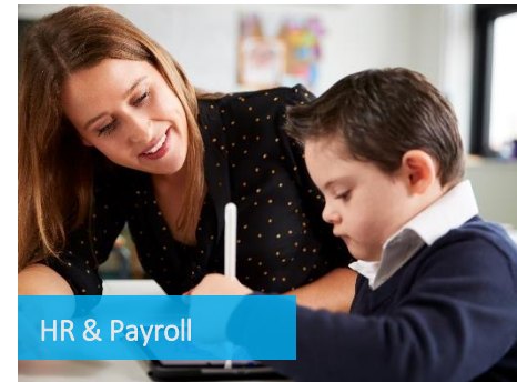
HR & Payroll