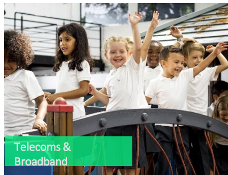
Telecoms & Broadband