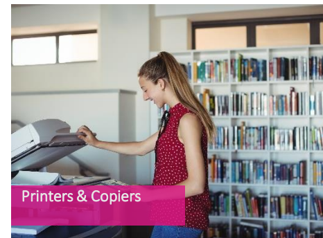
Printers & Copiers