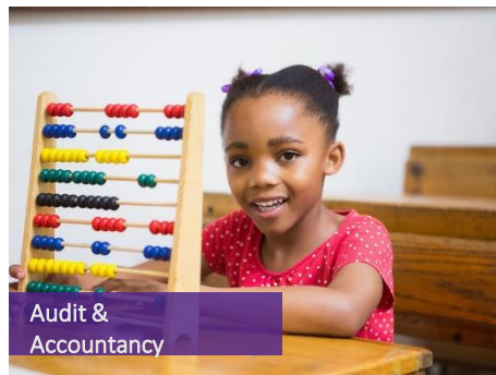
Audit & Accountancy